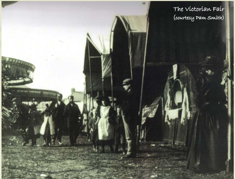
The Victorian Fair

Your Garden. Another source of information is people's gardens. The Common used to be almost twice as large as it is now, extending to the eastern side of Main Road. This means that most of the houses in the village are built on what used to be the common.