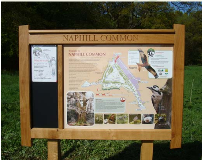
Above: The new information board at Forge Road. Below left: The old sign comes down. Centre: Precision techniques were used in the installation. Right: A high level of craftsmanship was used in the construction.

Naphill Common was made a Site of Special Scientific Interest (SSSI Grade 1) in 1951 because it was an example of self-generated woodland which, it was claimed, had never been planted or felled. In fact, there is plenty of evidence of felling - numerous tree stumps and several sawpits - but the designation is fairly accurate since it has never been planted and the felling was never extensive. The present woodland has grown up naturally from the original pollarded beeches and oaks, with birch, cherry, yew, holly, rowan, crab apple and goat willow coming in from elsewhere. Around the boundary there are some hornbeams and at least two whitebeams. Over by the Clumps at the