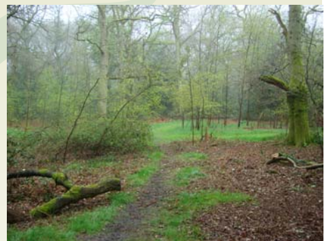
Before and after photographs show the amount of scrub clearance on a typical path near Chapel Lane.